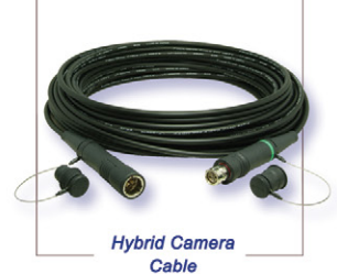
Hybrid Camera Cable