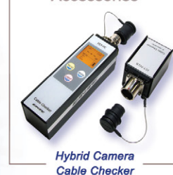
Hybrid Camera Cable Checker