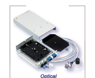
Optical Splice Box

canare.com | 973.837.0070 | sales@canare.com | hybrid fiber-optics & EO/OE | snake systems | connectors | cable reels | patchbays | cables